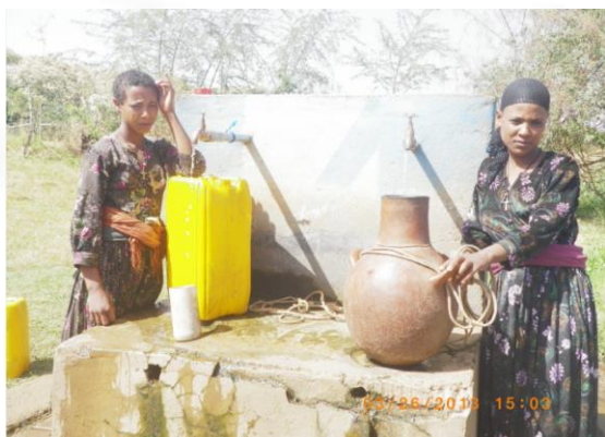
Figure 4. Functioning water point at Avola spring in Senkegna, Yilmana Densa.

(for men and women), and a masonry collection chamber for overnight storage.