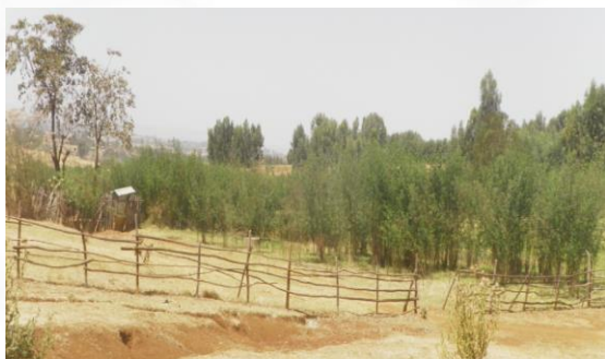
Figure 17. Buffer zone of Koma #1 hand dug well, Debremaawi, Yilmana Densa.

Initial investment for the facility only was € 703 8 Error! Bookmark not defined. , matched by a total of € 52 (15 ETB/ household) cash contribution and the equivalent of € 156 in labour and local materials during the construction. In addition, the hand pump was estimated to cost € 209.