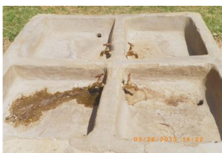
Figure 5. Laundry basins in good working order at Avola spring in Senkegna, Yilmana Densa.