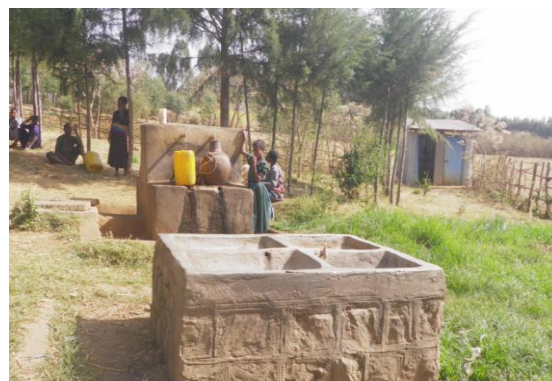
Figure 11. Overview of facilities at Araya spring in Kudad, Yilmana Densa: water point with 4 faucets, shower rooms in the background right, laundry basin in the foreground.

training by the CMP. The Araya spring has the usual components: laundry basins, shower rooms, collection chamber, two animal troughs (a large one for cattle and a smaller for goats and sheep), and a water point with four faucets. The facilities are used by 130 households.