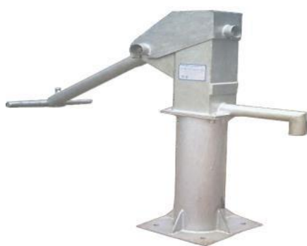
Figure 2. Afridev hand pump 5 .

The hand dug wells (up to 30 m deep) constructed under CMP are usually internally lined with concrete rings, equipped with masonry or concrete head works (i.e. apron, parapet, drainage, stairs) and installed with an Afridev type hand pump. This is one of the commonly used hand pumps and relies on manual leverage to lift water through the development of a vacuum and positive displacement.