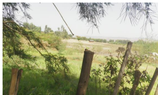
Figure 8. Source protection (buffer zone) at Avola spring in Senkegna, Yilmana Densa.

The spring was developed in January 2006 as part of the practical training for artisans under CMP. The major maintenance undertaken so far was replacement of the gate valve and some faucets. All components were operational during a field visit in March 2013. Discharge of the spring could not be measured because of its capping, necessary to protect it against advancing gullies 7 .