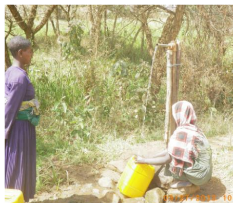
Figure 12. Water point without faucet at Araya spring in Kudad, Yilmana Densa.

During the field visit in May 2013 the gate valves to control the flow to cattle troughs and shower rooms were damaged and needed replacement. Similarly, only one out of the four faucets of the laundry basin was functional. Users made their own adaptations, e.g. simply blocking the water flow to the cattle trough, but obviously the facilities cannot be used according to the design.