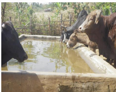
Figure 13. Cattle trough at Araya spring in Kudad, Yilmana Densa.

Apart from the health benefits of the WASH facilities, the community profits from income generated from cattle, drinking from the cattle trough.