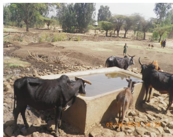
Figure 7. Cattle trough in use at Avola spring in Senkegna, Yilmana Densa.

The spring was developed in January 2006 as part of the practical training for artisans under CMP. The major maintenance undertaken so far was replacement of the gate valve and some faucets. All components were operational during a field visit in March 2013. Discharge of the spring could not be measured because of its capping, necessary to protect it against advancing gullies 7 .