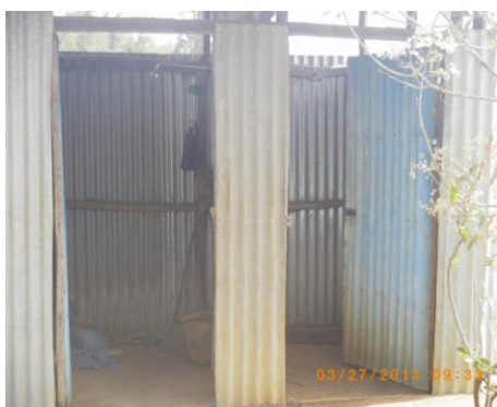
Figure 6. Shower rooms at Avola spring in Senkegna, Yilmana Densa. It is not clear whether these are actually used by the community.