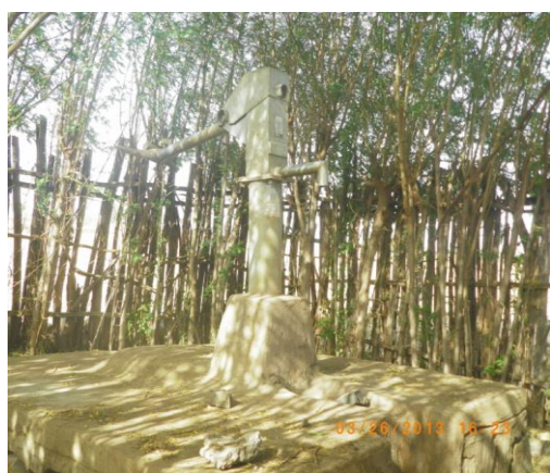
Figure 15. Afridev-type pump at Shine Mender hand dug well, repaired with wooden handle.

The pump has a lock, to prevent children from pumping it unnecessarily, and a fenced area around the water point and also its protection area (buffer zone). No additional facilities have been constructed. Users take turns in keeping the key, so that they do not have to spend money on a guard 9 .