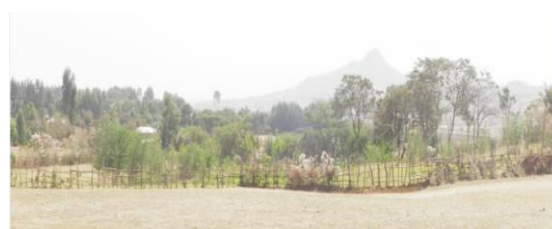
Figure 3. Source protection (buffer zone) at Araya spring in Yilmana Densa.

Community water supplies are ideally constructed on communal land, where both the water facility and the land belong to the community, so that relatively large areas around water sources can be kept as protection zones. By restricting access to people and animals, the buffer zone is protected from land degradation, hence preventing erosion that may lead to gully formation that would endanger the infrastructure. At the same time, the water source area is protected from anthropogenic contamination as upstream sources of contaminants can be trapped and groundwater recharge is enhanced locally. In this way, locally protected buffer zones can contribute towards improving both water quantity and quality, thereby increasing water supply sustainability 6 .