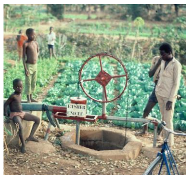
SUBSISTENCE IRRIGATION FROM GROUNDWATER IN SUB-SAHARAN AFRICA