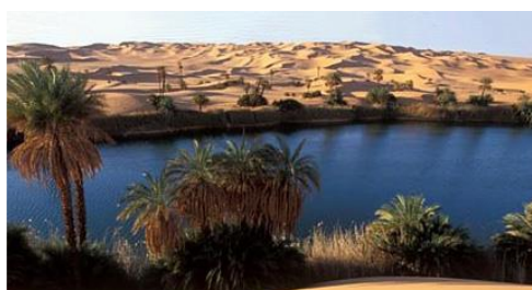
A SAHARAN OASIS – FORMED BY GROUNDWATER

Almost all the fresh water in the world is groundwater and life would not be possible without it. It is found in large quantities in underground aquifers - rocks, sands and gravels, and is replenished by rain and melting snow. It sustains life even in periods of drought and feeds springs, rivers, lakes and wetlands, and seeps into our oceans. It is extracted to the surface by pumps and wells, and supplies the water we use for drinking, sanitation and agriculture. It also supports ecosystems, such as marshes and rivers. Groundwater maintains internationally important wetlands, often giving rise to distinctive ecosystems.