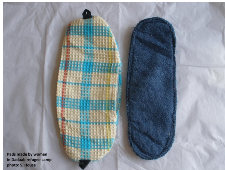
Re-usable pads made by a women's group in Dadaab refugee camp, Kenya