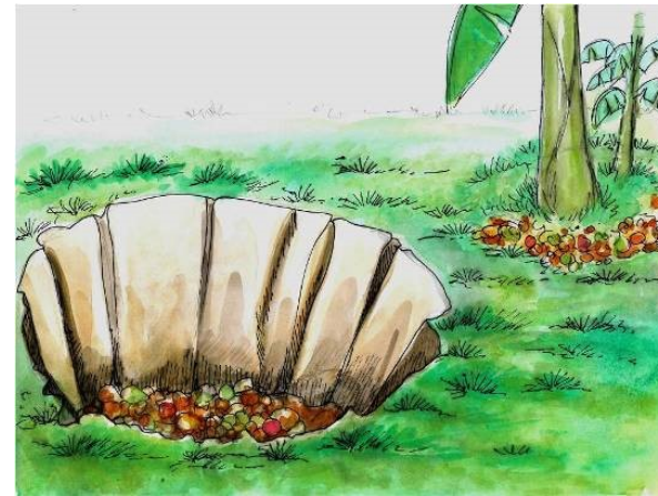
4. Waste pit – buried