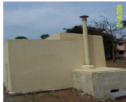
3. Incinerator attached to toilet block