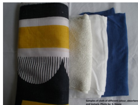
Pieces of cloth, towel, old saris and other materials are commonly used