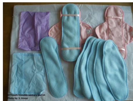
AFRIPads menstrual hygiene kit, Uganda