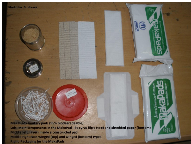
MakaPads (biodegradable, papyrus) – made in Uganda