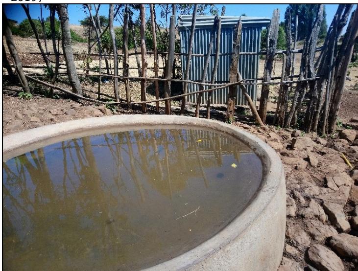
Cattle through for the animals.

The community, led by the WASHCO, applied this project from Yilmana Densa Woreda Water Office in 2006. The application was approved and WASHCO members were trained in construction management. The construction started in February 2007 and project was completed in one-month time by March 20, 2007 (12 years ago). The water supply was constructed using CMP approach. This means that the community was managing the entire