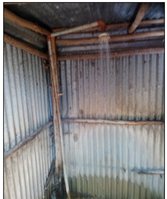
Shower for the community and outsiders. Photo by Arto in Jan 2019)