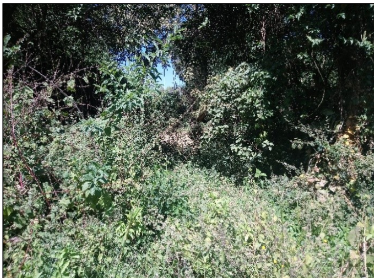
Exemplary micro-watershed protection providing sustainable water supply throughout the year.

There are numerous unique features about this spring. Among many, the special feature of the spring is the protection of the micro water-shed and its management. From the beginning, the community and Kebele Administration understood the issue of sustainability and hence they built watershed protection to make the water supply sustainable. This was agreed by the community to close the upstream area to protect the source. Since the past 12 years to date, the watershed has become a jungle and provides continuous, good quality and adequate water for the community. Currently, the community is aware of the value of this protection and is proud and committed to taking a good care of it.