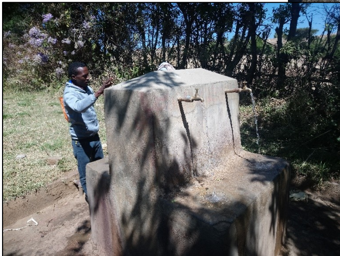
Water collection point with 4 taps.