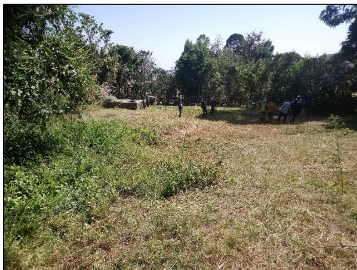
Open area inside the closed watershed where the grass grows and provides income for the water supply maintenance.

During the project application period, the community contributed Birr 1,000 as up-front cash and saved this money to their O&M account. There is no tariff collection to date as the community cuts the grass three times per year from the closed area and sells it with Birr 2,400 per year. Other income for O and M comes from shower service rendered by the WASCHO. Shower fee was in the beginning 1 Birr/person, but has now increased to 5 Birr/person because of too much need by residents outside the community. Mainly teachers, health extension workers and development workers are the regular customers during the weekends. There is also a hired guard for the water scheme. The guard is female. She has been serving seven years. When she started the guarding